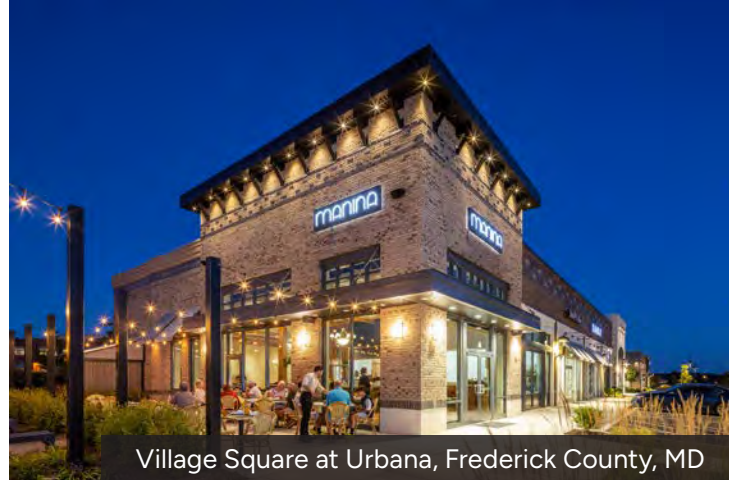
Village Square at Urbana, Frederick County, MD