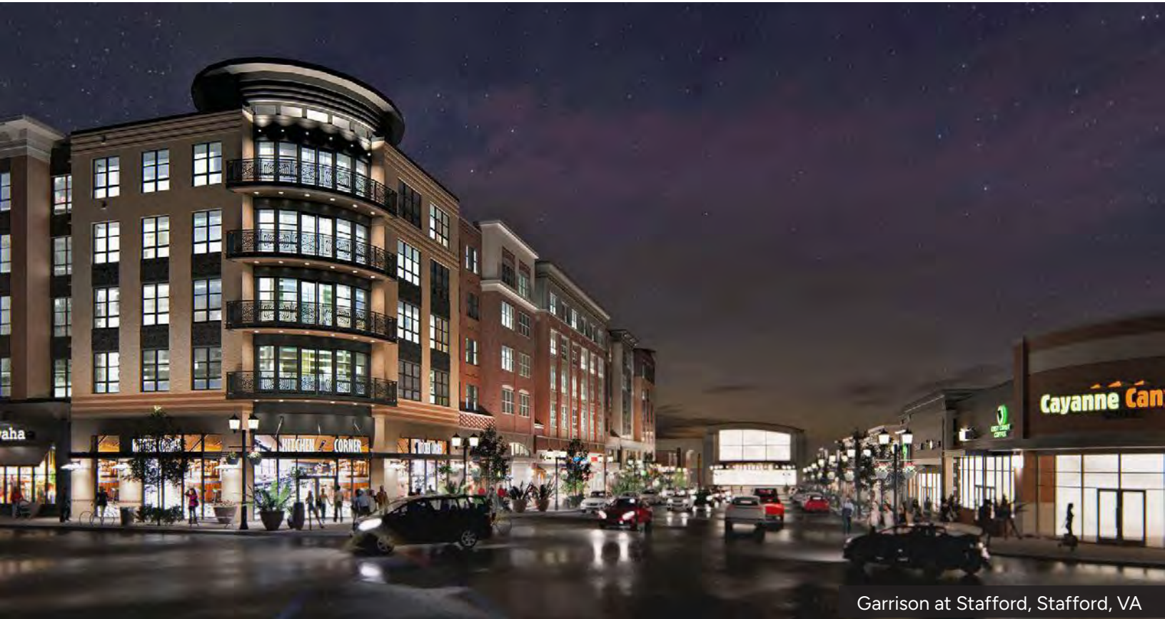
Garrison at Stafford, Stafford, VA

B ignell Watkins Hasser Architecture & Interiors (BWH) is an award-winning architecture and interior design firm with a diverse portfolio of work in both the Public and Private sectors. We have built a reputation for being technically strong, creative designers who believe collaboration is the key to success. Our multi-disciplinary team has a depth of knowledge and experience that enables us to provide creative solutions for complex projects with budget and timeline in mind.