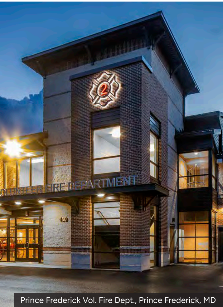
Prince Frederick Vol. Fire Dept., Prince Frederick, MD