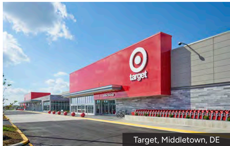
Target, Middletown, DE

OUR TEAM has a dynamic approach guided by creativity, collaboration, and design excellence. Office leadership has decades of experience in architecture and interior design with an emphasis on thought-leadership, best practices, and cultivating talent and new ideas.