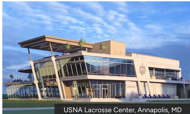
USNA Lacrosse Center, Annapolis, MD