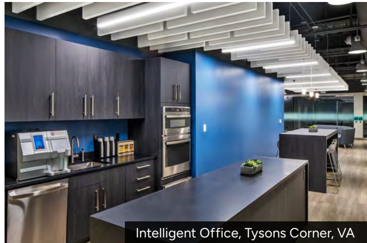
Intelligent Office, Tysons Corner, VA