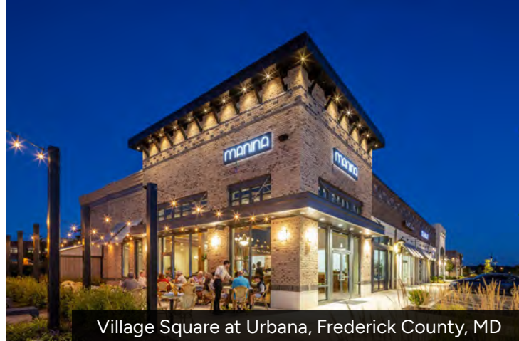
Village Square at Urbana, Frederick County, MD