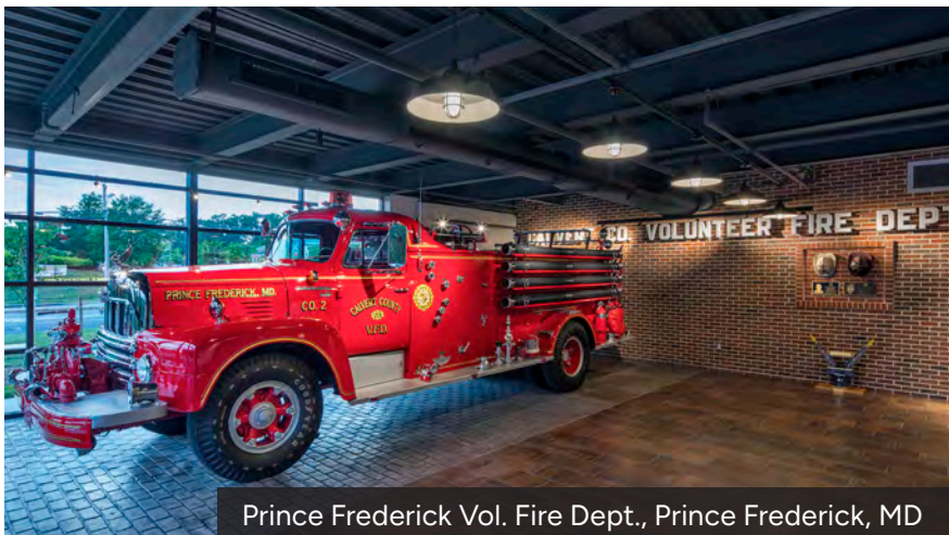
Prince Frederick Vol. Fire Dept., Prince Frederick, MD

BWH designed this high value/low maintenance state-of-the-art station for Prince Frederick Volunteer Fire Company. This 30,000 sf. facility includes five drive-thru apparatus bays plus a wash bay. The living and administration areas contain office space, bunkrooms, kitchen/dining space, training room and support space to accommodate shift personnel. A museum area and meeting spaces are open to the public. The facility is designed to adhere to the "hot zone" concept of separating contaminated areas from clean living spaces.