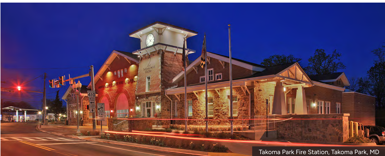
Takoma Park Fire Station, Takoma Park, MD

storage areas, fitness and training rooms, lounges, and kitchens. BWH uses a collaborative, team-based approach to develop thoughtful and functional designs, strengthened by ongoing education and industry best practices. Our active involvement in national fire station design symposiums and firehouse expos, coupled with strong partnerships with fire departments throughout the region, serves as the foundation for designing exemplary facilities for both volunteer and career firefighters.