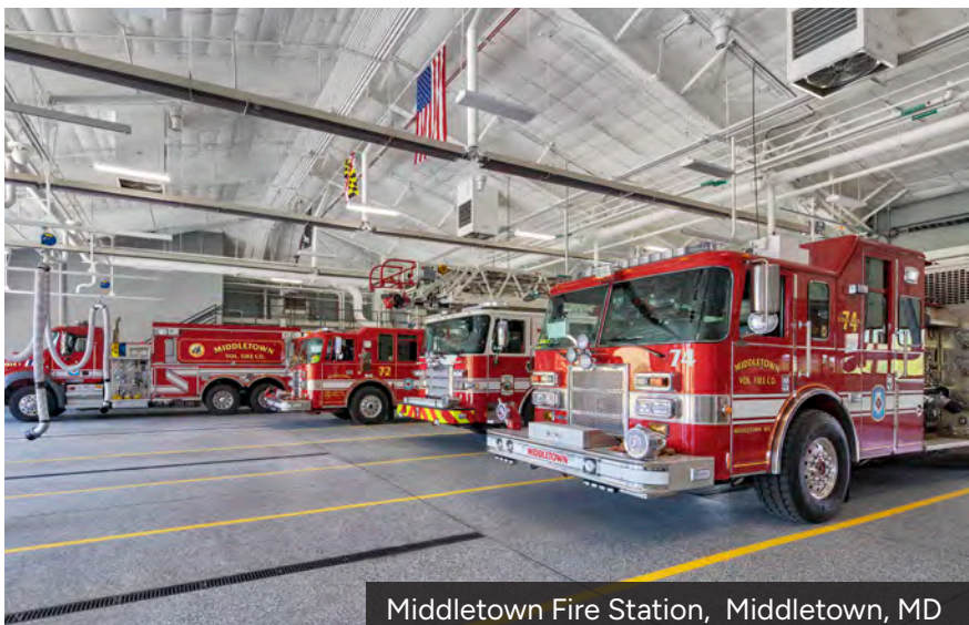
Middletown Fire Station, Middletown, MD