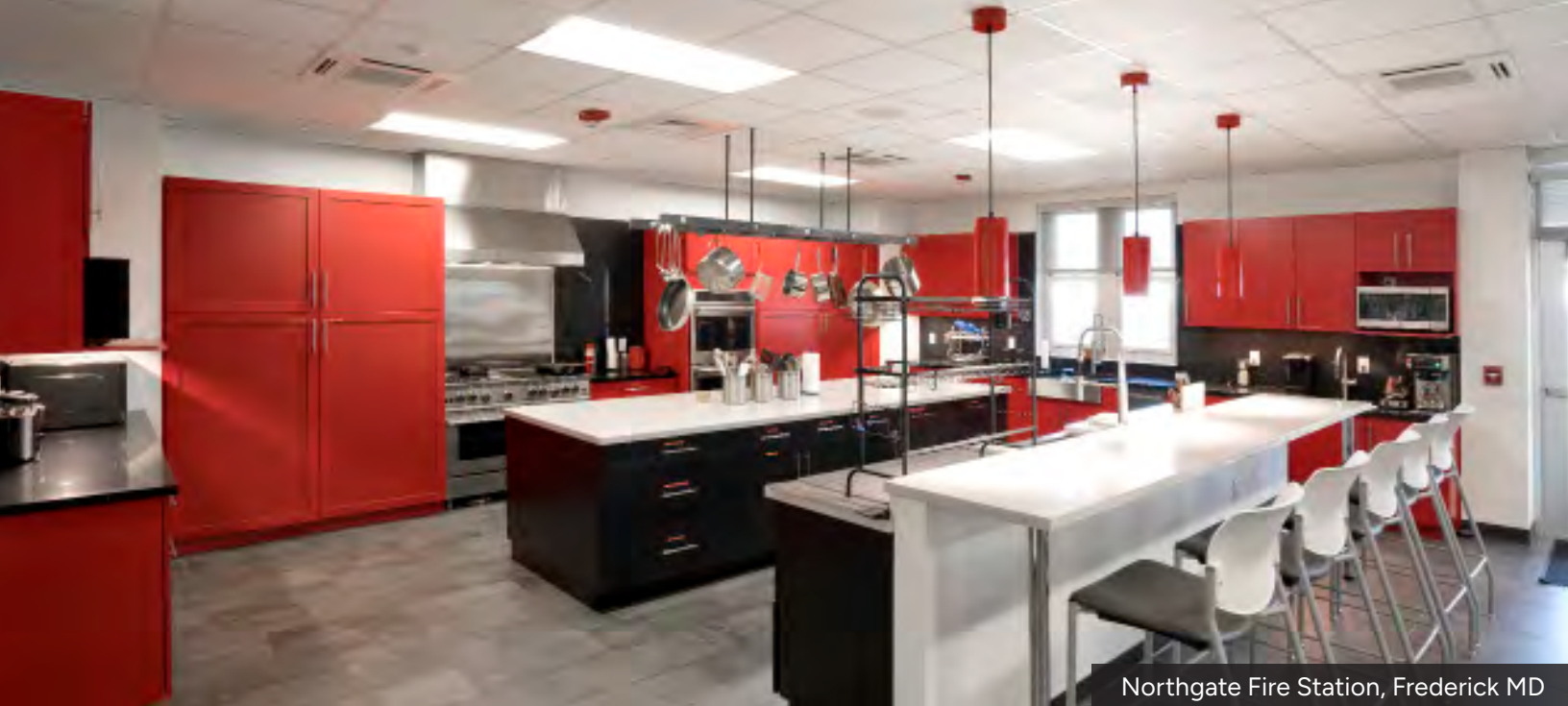
Northgate Fire Station, Frederick MD