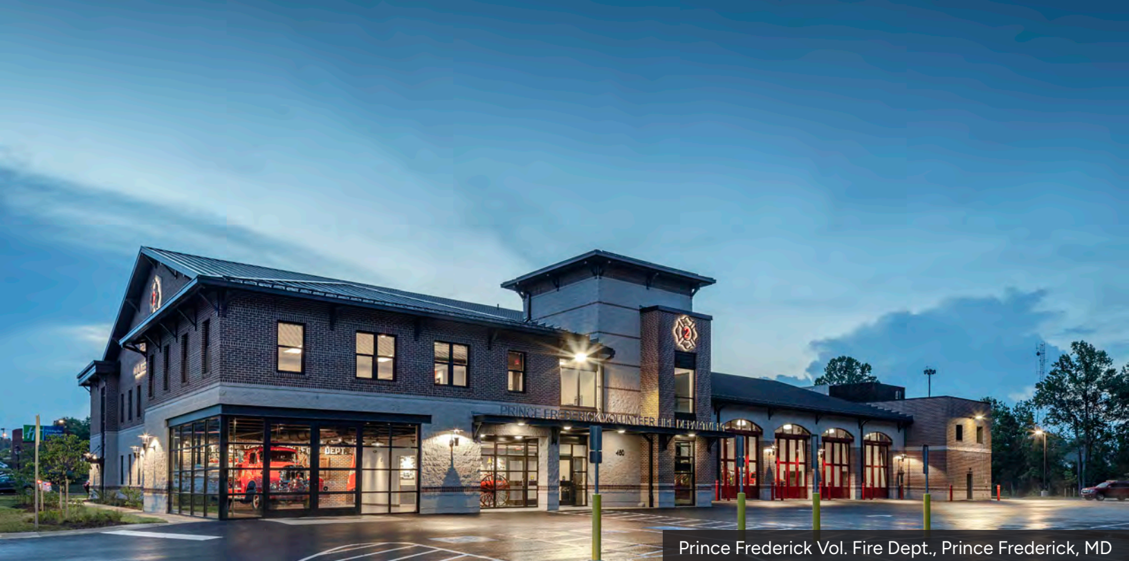
Prince Frederick Vol. Fire Dept., Prince Frederick, MD