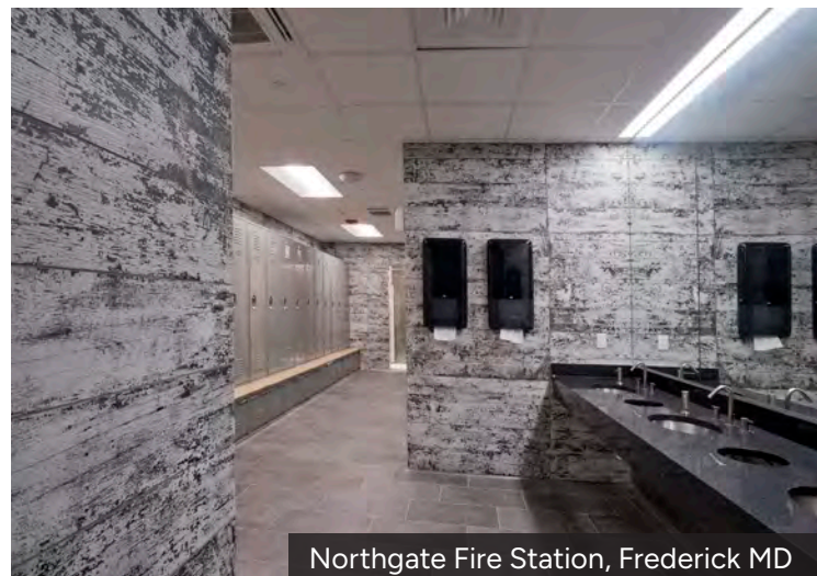
Northgate Fire Station, Frederick MD