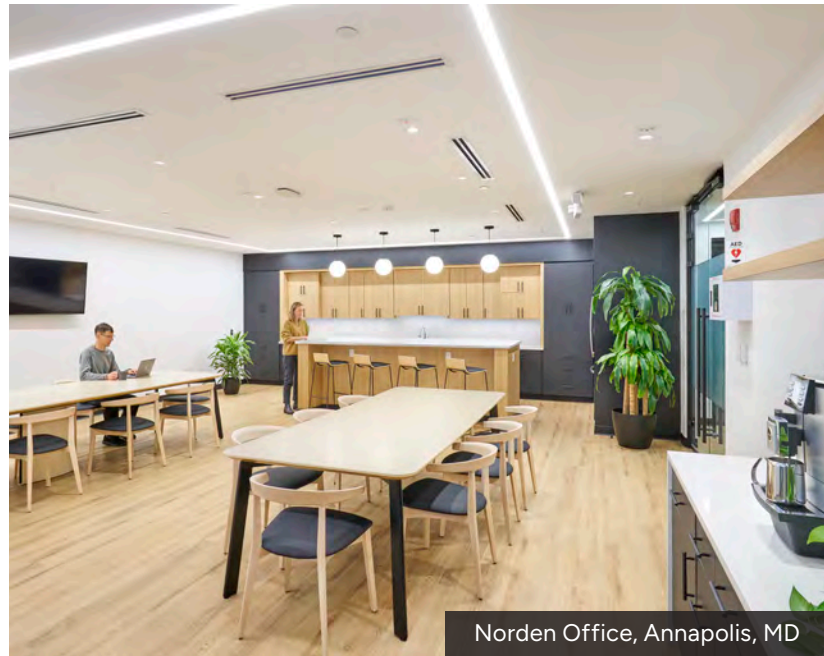
Norden Office, Annapolis, MD

BWH designed the interior fit-out for the Annapolis, MD location of one of Denmark's oldest internationally operating shipping companies. The client's objectives were to create a well-branded environment with flexible spaces that support their unique work processes, enhance employee well-being, and accommodate future growth. The minimalistic aesthetic is a nod to the company's Scandinavian heritage, with light, neutral colors, wood finishes and sleek, contemporary furniture striking a balance between functionality, modernism, and comfort. The resulting project is a hip, high-performance, amenity-rich space that is a testament to the client's success.