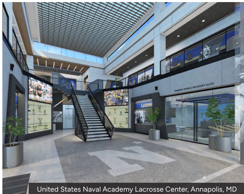
United States Naval Academy Lacrosse Center, Annapolis, MD

The Center features a state of the art strength and conditioning facility, locker rooms, a hydrotherapy room, an 80 seat theater, coaches' offices, ward rooms, and roof-top terraces with unmatched views of the Severn River and practice fields.