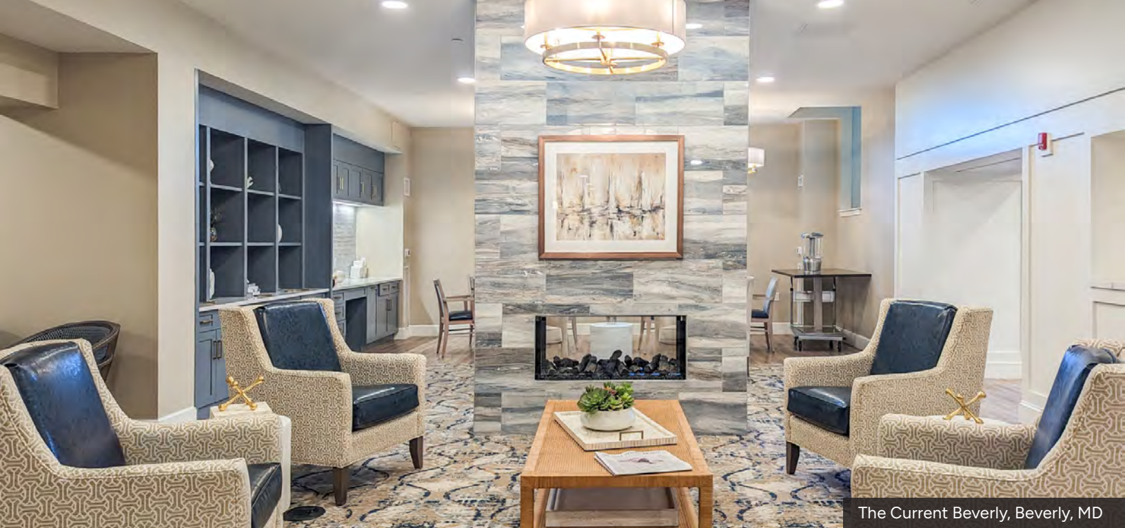
The Current Beverly, Beverly, MD