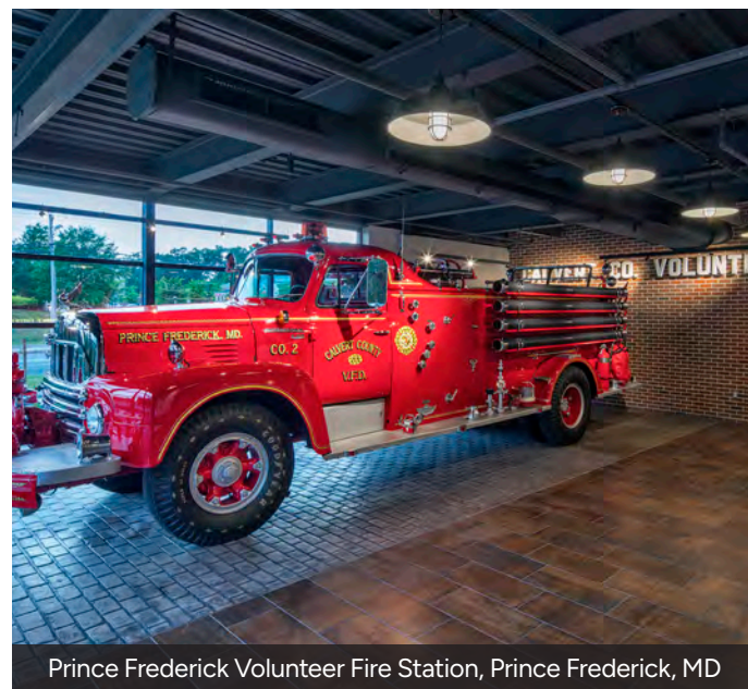
Prince Frederick Volunteer Fire Station, Prince Frederick, MD