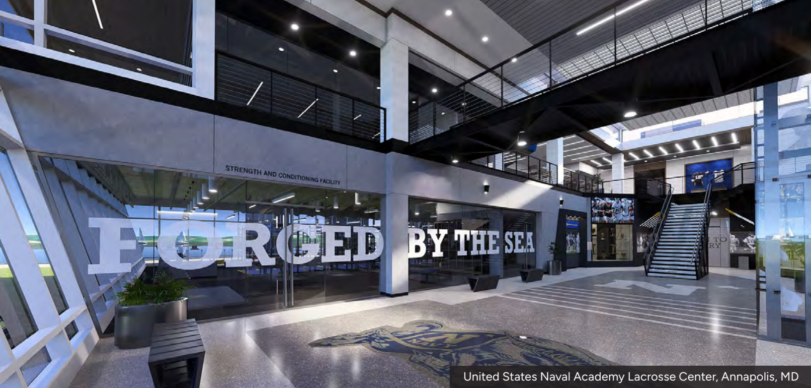
United States Naval Academy Lacrosse Center, Annapolis, MD