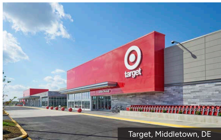
Target, Middletown, DE

OUR TEAM has a dynamic approach guided by creativity, collaboration, and design excellence. Office leadership has decades of experience in architecture and interior design with an emphasis on thought-leadership, best practices, and cultivating talent and new ideas.