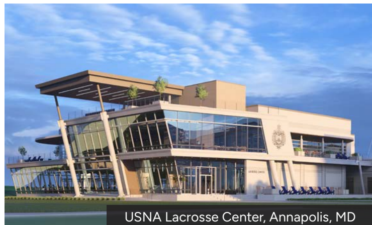
USNA Lacrosse Center, Annapolis, MD