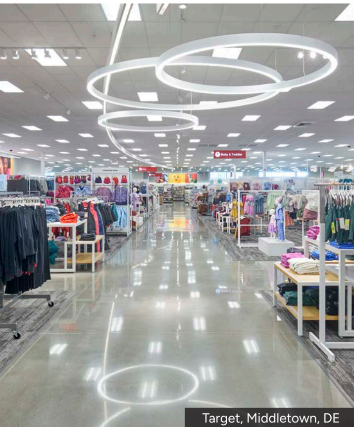
Target, Middletown, DE

We approach each project from a holistic viewpoint with overall design and human wellness at the forefront. Our architects and interior designers take a proactive approach to designing modern and sustainable buildings that are guided by the Leadership in Energy and Environmental Design® (LEED®) green building program and WELL Building Standard™ (WELL™). From improved air quality and sustainable water management to occupant health and wellness, our designs aim to positively impact the people who live, work and occupy the spaces for the life of the building.