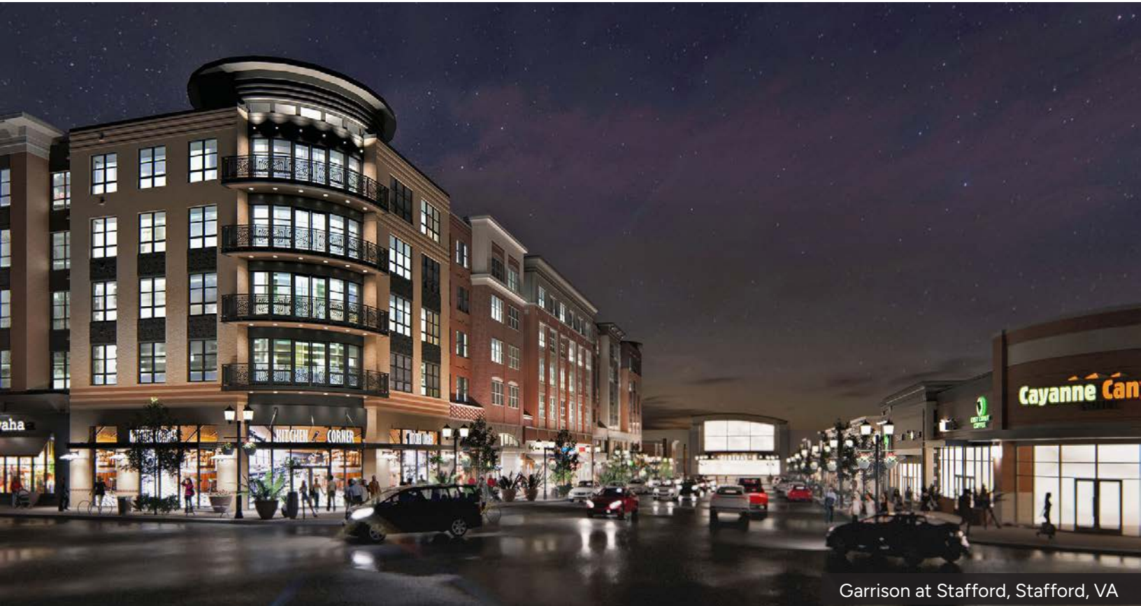
Garrison at Stafford, Stafford, VA

B ignell Watkins Hasser Architecture & Interiors (BWH) is an award-winning architecture and interior design firm with a diverse portfolio of work in both the Public and Private sectors. We have built a reputation for being technically strong, creative designers who believe collaboration is the key to success. Our multi-disciplinary team has a depth of knowledge and experience that enables us to provide creative solutions for complex projects with budget and timeline in mind.