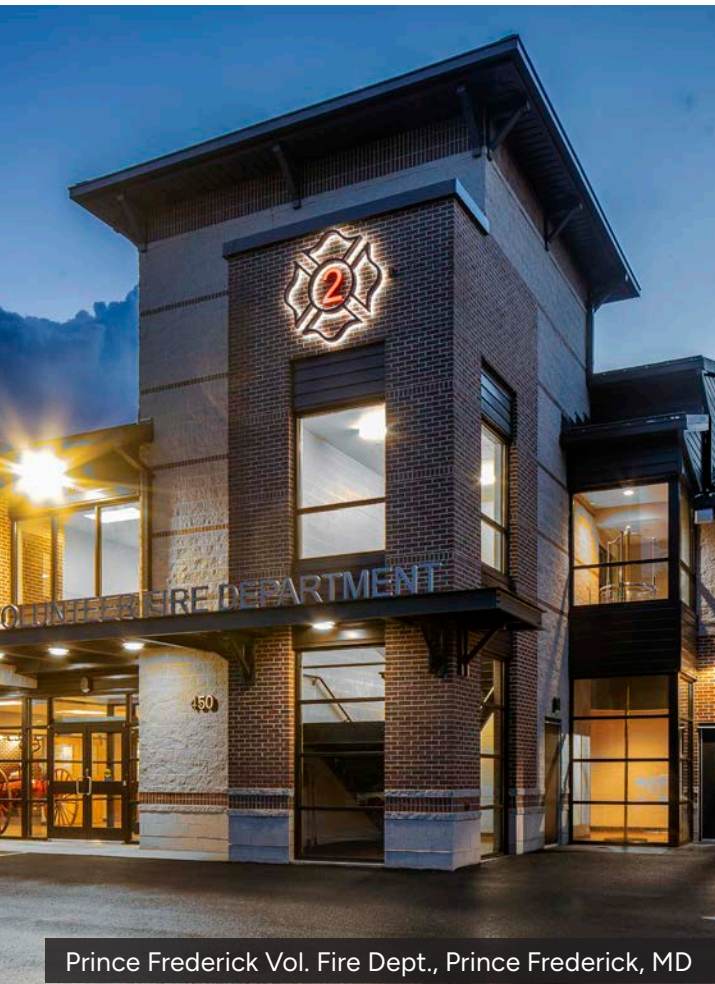
Prince Frederick Vol. Fire Dept., Prince Frederick, MD