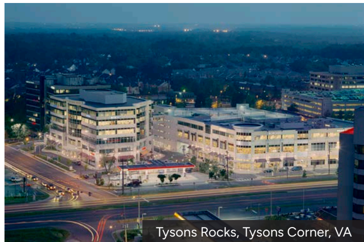
Tysons Rocks, Tysons Corner, VA