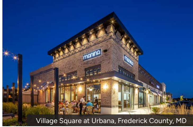
Village Square at Urbana, Frederick County, MD