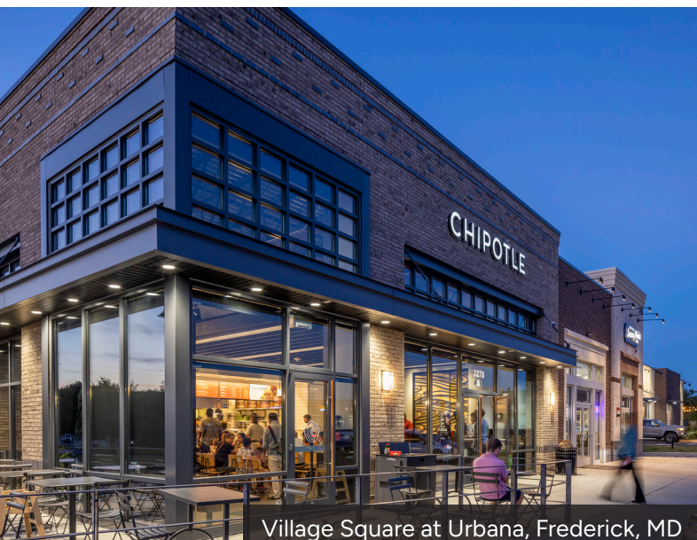
Village Square at Urbana, Frederick, MD

We specialize in designing dynamic, inviting restaurant spaces that blend aesthetic appeal with functionality. With a history working alongside retail developers and restaurateurs, we understand the unique challenges of creating environments that enhance the dining experience. From concept to completion, our team crafts thoughtful designs that reflect the vision of each restaurant while optimizing flow, comfort, and ambiance. Whether it's a cozy bistro, a vibrant urban hotspot, or a high-end dining experience, we bring expertise and passion to every project, ensuring each space is as unforgettable as the meals served within it.