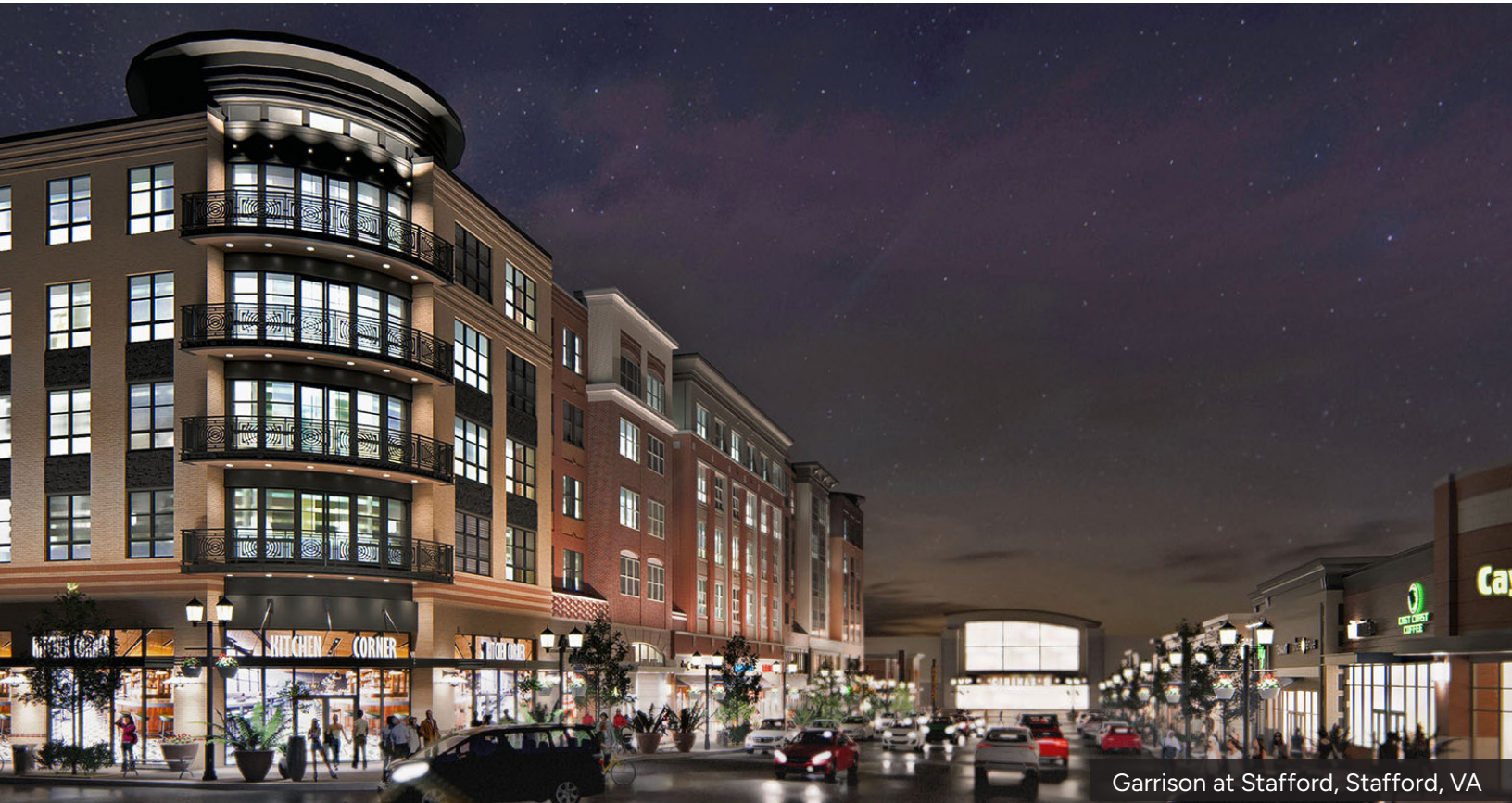
Garrison at Stafford, Stafford, VA

B ignell Watkins Hasser Architecture & Interiors (BWH) is an award-winning architecture and interior design firm with a diverse portfolio of work in both the Public and Private sectors. We have built a reputation for being technically strong, creative designers who believe collaboration is the key to success. Our multi-disciplinary team has a depth of knowledge and experience that enables us to provide creative solutions for complex projects with budget and timeline in mind.