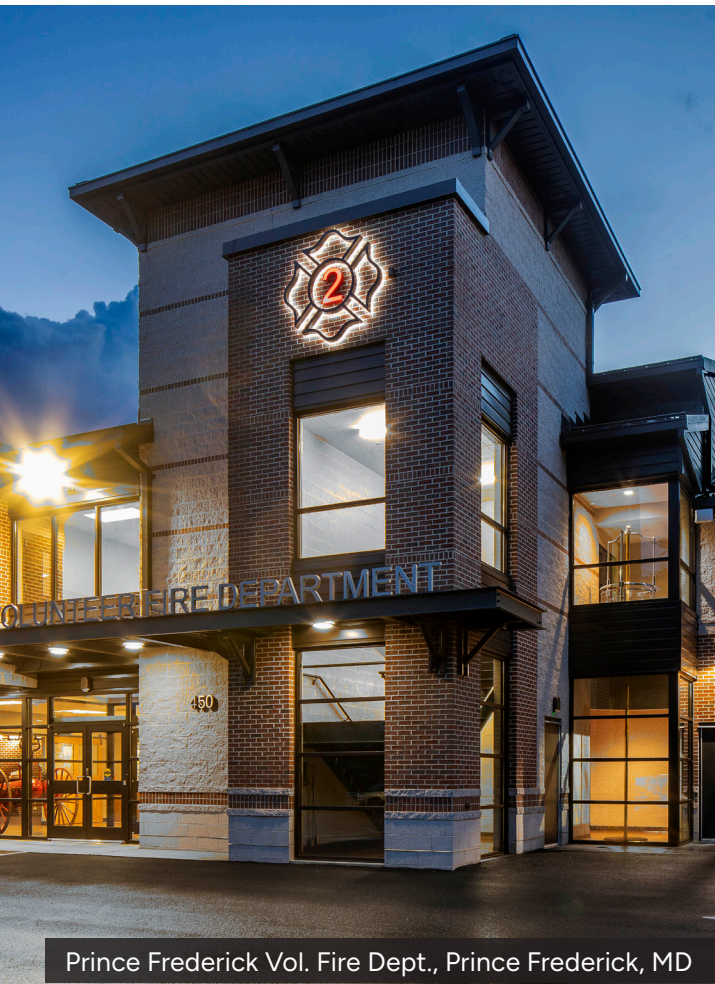
Prince Frederick Vol. Fire Dept., Prince Frederick, MD