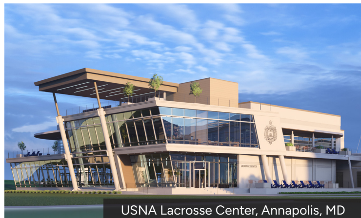
USNA Lacrosse Center, Annapolis, MD