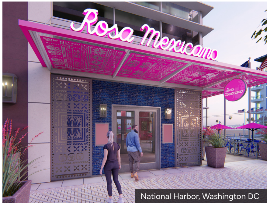
National Harbor, Washington DC

Our team worked closely with Rosa Mexicano to craft a design that honors the restaurant's legacy. From the dynamic layout to the meticulously curated details, every element was thoughtfully designed to enhance the guest experience and complement the restaurant's mission of delivering an exceptional dining experience rooted in tradition and innovation.