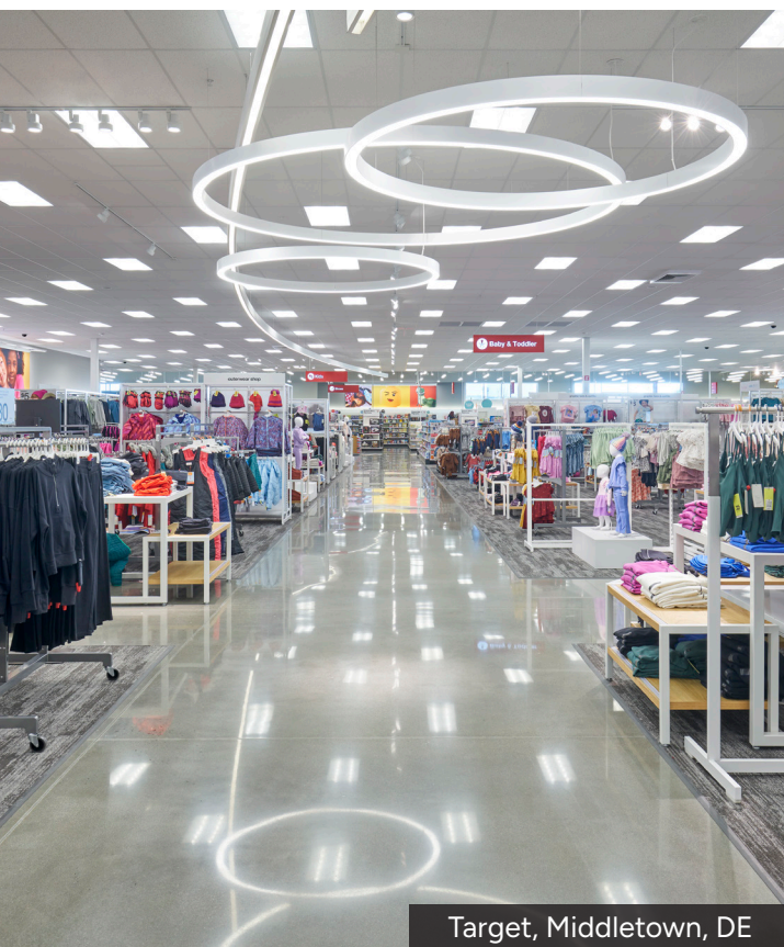
Target, Middletown, DE

We approach each project from a holistic viewpoint with overall design and human wellness at the forefront. Our architects and interior designers take a proactive approach to designing modern and sustainable buildings that are guided by the Leadership in Energy and Environmental Design® (LEED®) green building program and WELL Building Standard™ (WELL™). From improved air quality and sustainable water management to occupant health and wellness, our designs aim to positively impact the people who live, work and occupy the spaces for the life of the building.