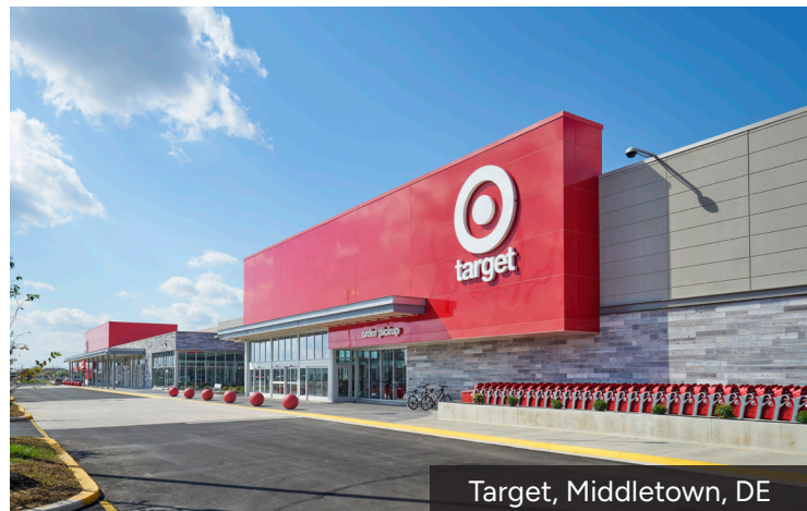
Target, Middletown, DE

OUR TEAM has a dynamic approach guided by creativity, collaboration, and design excellence. Office leadership has decades of experience in architecture and interior design with an emphasis on thought-leadership, best practices, and cultivating talent and new ideas.