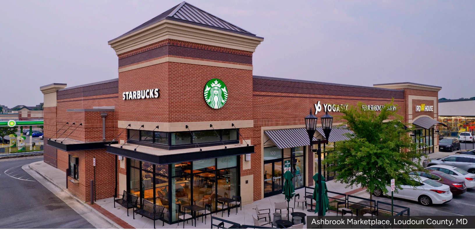
Ashbrook Marketplace, Loudoun County, MD