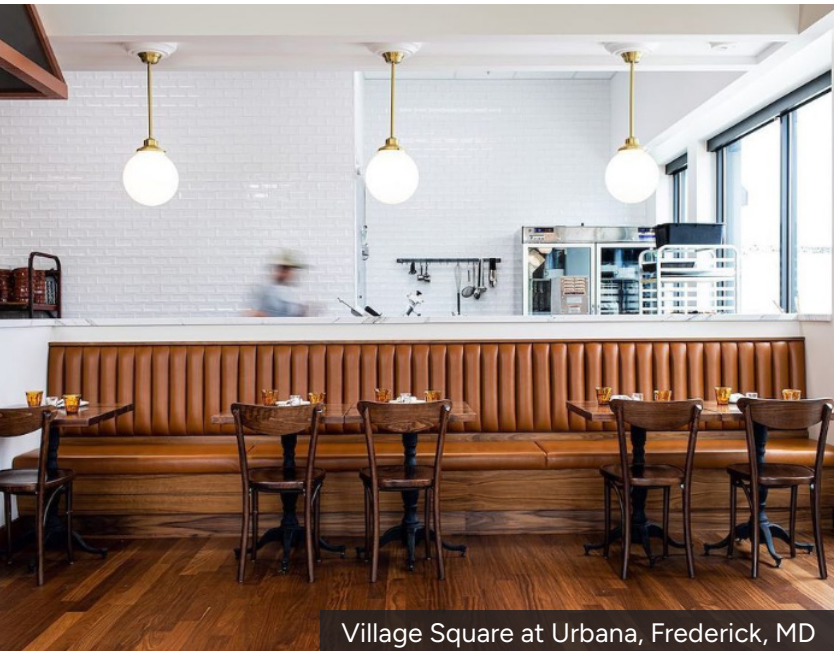
Village Square at Urbana, Frederick, MD