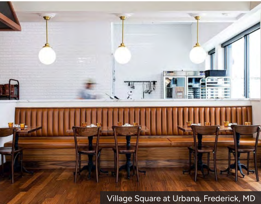
Village Square at Urbana, Frederick, MD