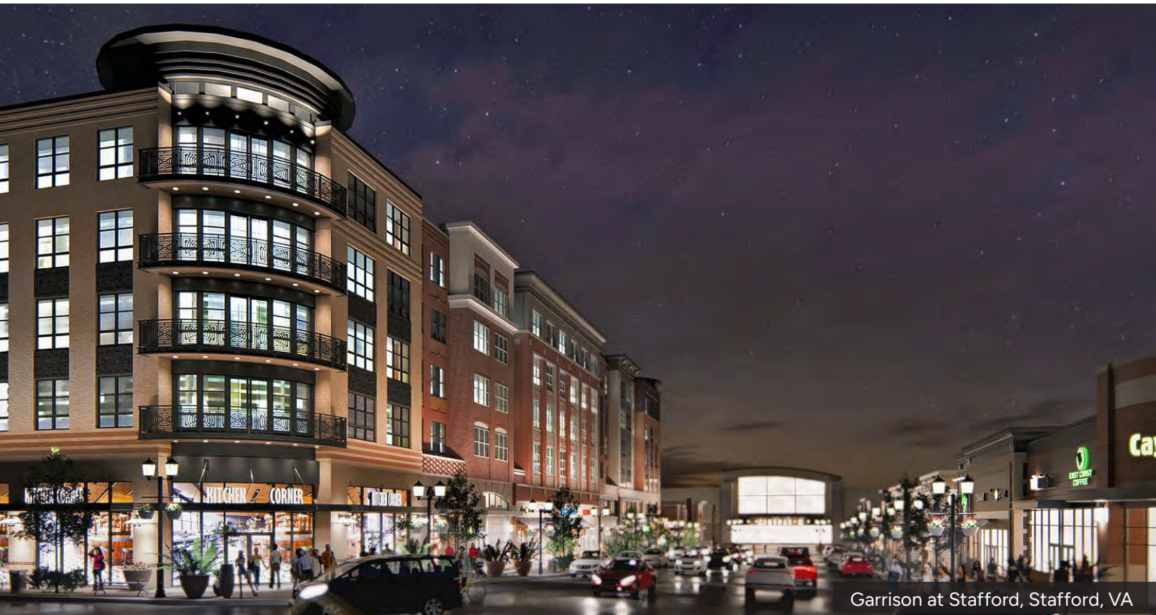
Garrison at Stafford, Stafford, VA

B ignell Watkins Hasser Architecture & Interiors (BWH) is an award-winning architecture and interior design firm with a diverse portfolio of work in both the Public and Private sectors. We have built a reputation for being technically strong, creative designers who believe collaboration is the key to success. Our multi-disciplinary team has a depth of knowledge and experience that enables us to provide creative solutions for complex projects with budget and timeline in mind.