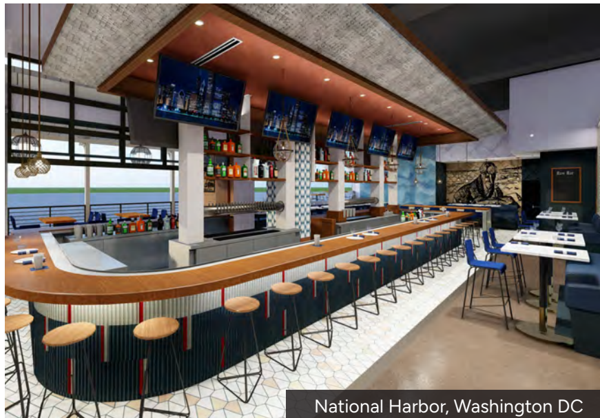
National Harbor, Washington DC

Currently in progress at National Harbor, The Walrus Oyster & Ale House will offer an exceptional seafood dining experience within a modern, coastal-inspired setting. BWH is providing architectural and interior design services, crafting a space that reflects the restaurant's focus on fresh, high-quality seafood and a relaxed yet sophisticated atmosphere. Working closely to bring the owner's vision to life, our team is collaborating with a local artist to create custom murals and artwork. Every detail, from nautical elements to warm, inviting materials, will be thoughtfully selected to create a welcoming space that complements the restaurant's coastal charm.