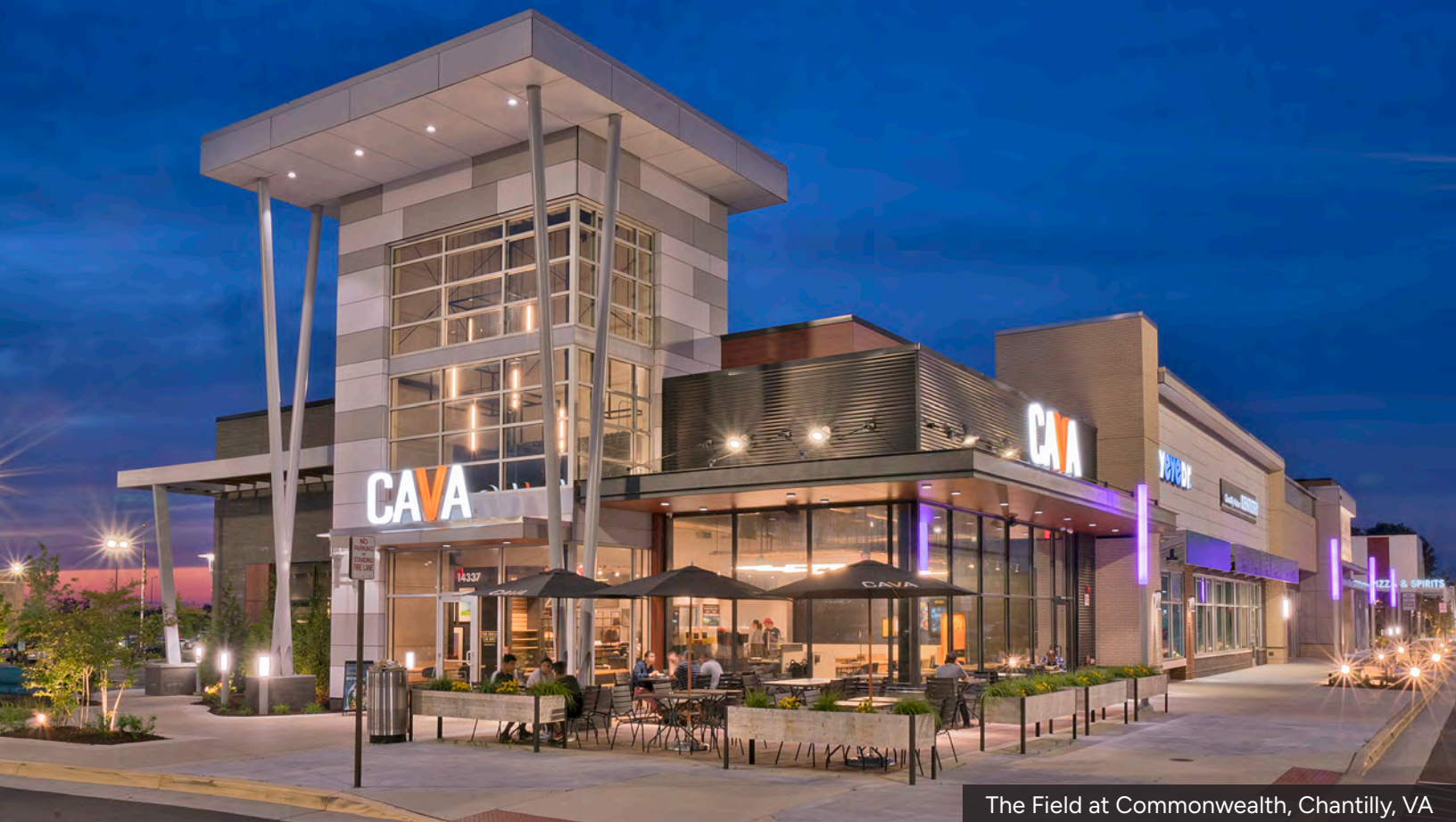
The Field at Commonwealth, Chantilly, VA