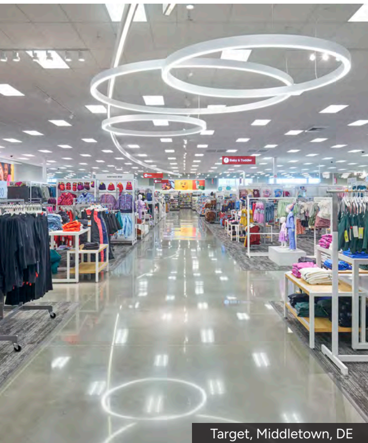
Target, Middletown, DE

We approach each project from a holistic viewpoint with overall design and human wellness at the forefront. Our architects and interior designers take a proactive approach to designing modern and sustainable buildings that are guided by the Leadership in Energy and Environmental Design® (LEED®) green building program and WELL Building Standard™ (WELL™). From improved air quality and sustainable water management to occupant health and wellness, our designs aim to positively impact the people who live, work and occupy the spaces for the life of the building.