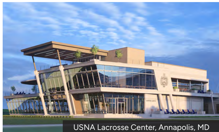
USNA Lacrosse Center, Annapolis, MD