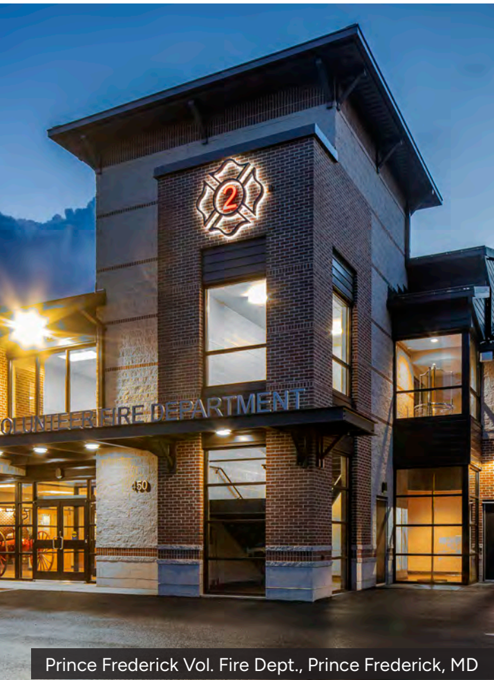
Prince Frederick Vol. Fire Dept., Prince Frederick, MD