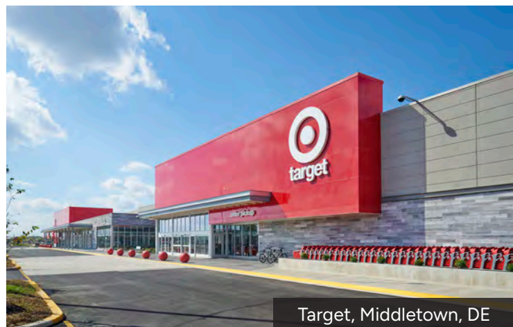
Target, Middletown, DE

OUR TEAM has a dynamic approach guided by creativity, collaboration, and design excellence. Office leadership has decades of experience in architecture and interior design with an emphasis on thought-leadership, best practices, and cultivating talent and new ideas.