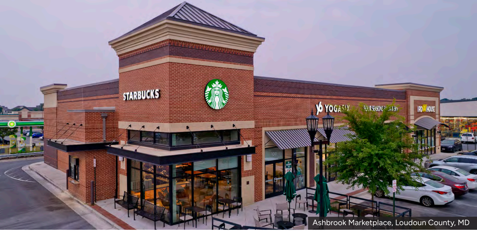
Ashbrook Marketplace, Loudoun County, MD