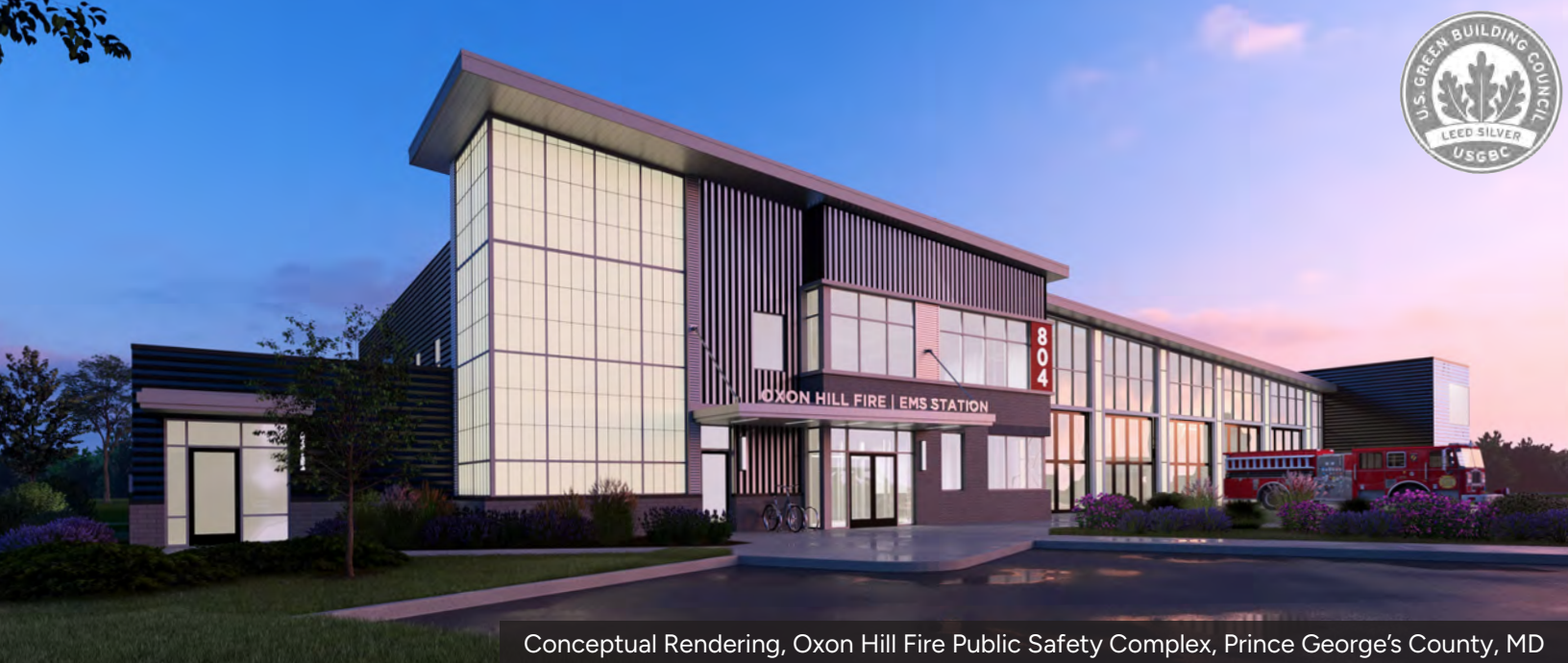
Conceptual Rendering, Oxon Hill Fire Public Safety Complex, Prince George's County, MD