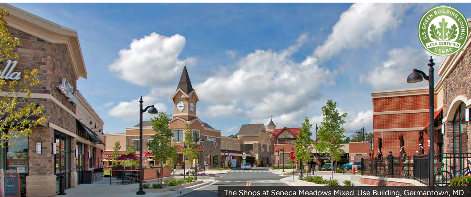
The Shops at Seneca Meadows Mixed-Use Building, Germantown, MD

To remain at the forefront of sustainable building practices, we actively support professional development by encouraging our architects to pursue accreditations as LEED Green Associates and LEED Accredited Professionals in Building Design & Construction. We also support our design team in becoming WELL Accredited Professionals. This expertise ensures our team stays at the forefront of sustainable building practices and empowers us to seamlessly integrate these advanced strategies into each project. Through our dedication to sustainability, we ensure our buildings exceed standards and make a positive impact on both the planet and its people.