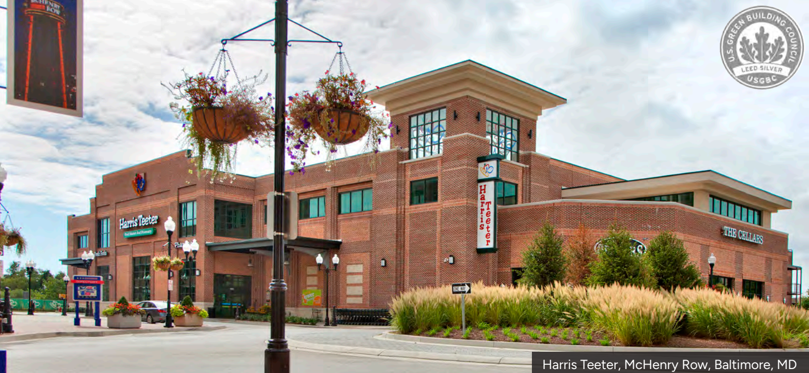
Harris Teeter, McHenry Row, Baltimore, MD